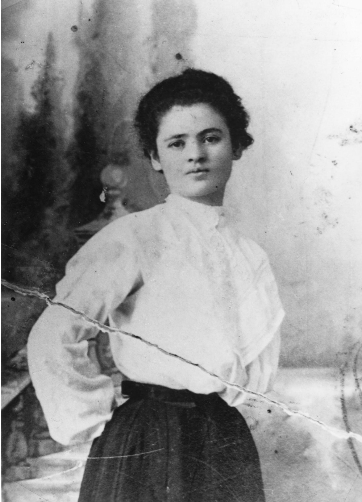
(Portrait of Clara Lemlich, one of the inspirations for the fictional "Leah Schwartz" character)