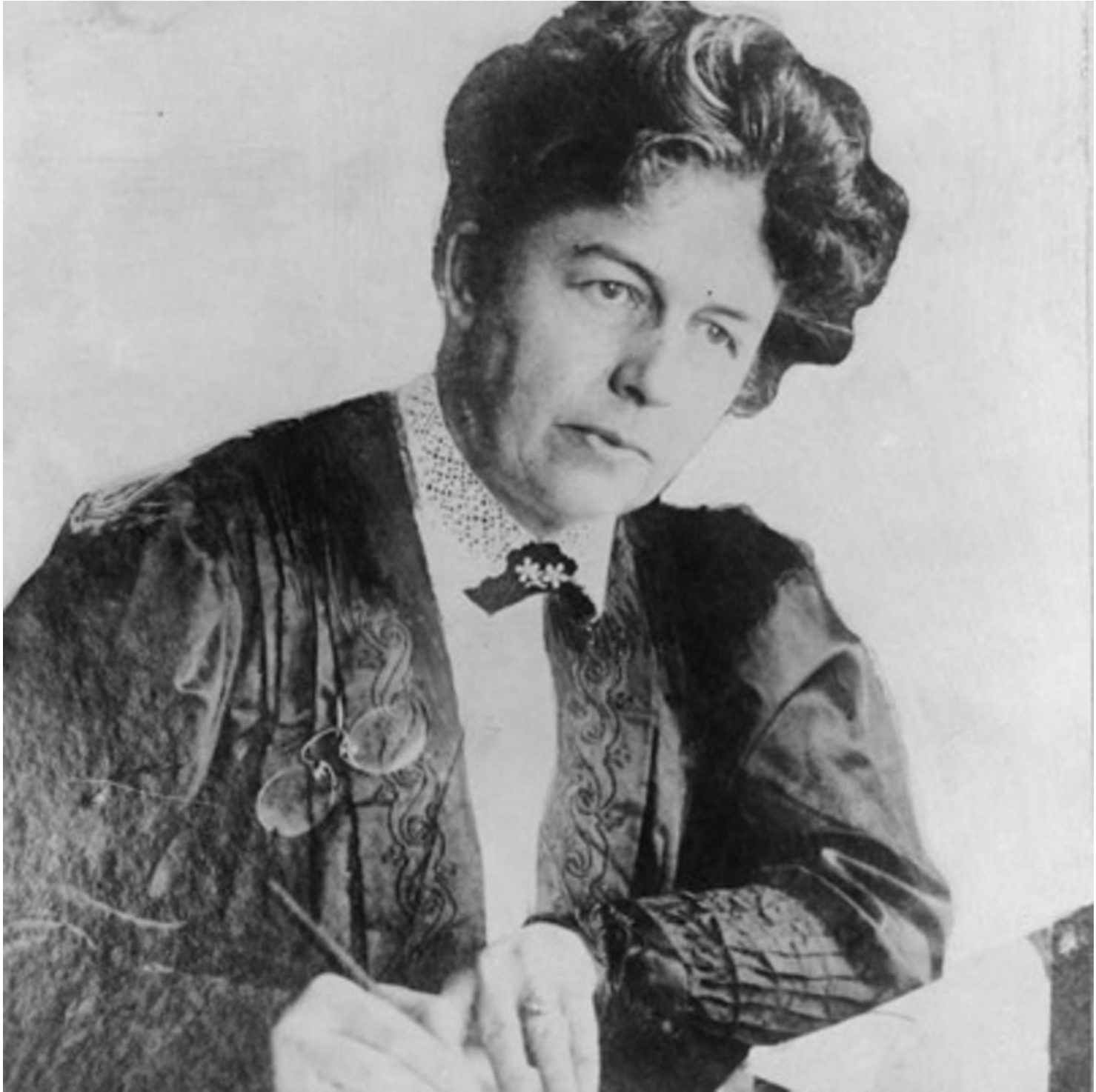
(Portrait of Harriet Stanton Blatch, one of the inspirations for the fictional “Maud Preston” character)